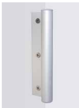
Standard door pull handle outside