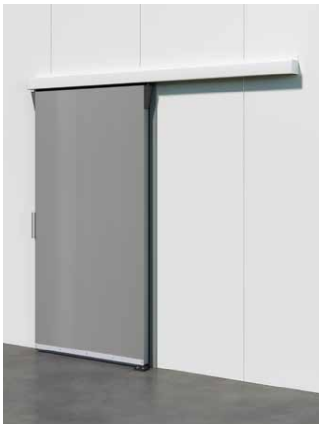
Cold-store room sliding door in special color RAL 7005