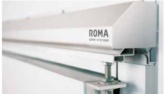
Sliding door hardware made of aluminum