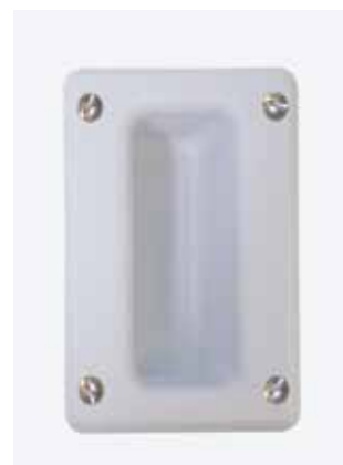
Standard inset pull handle inside