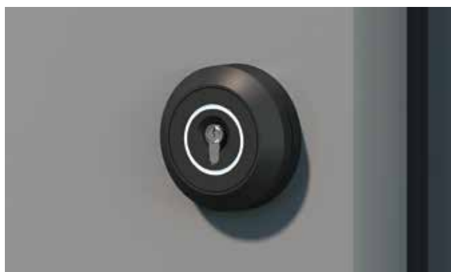
Optional bolt lock