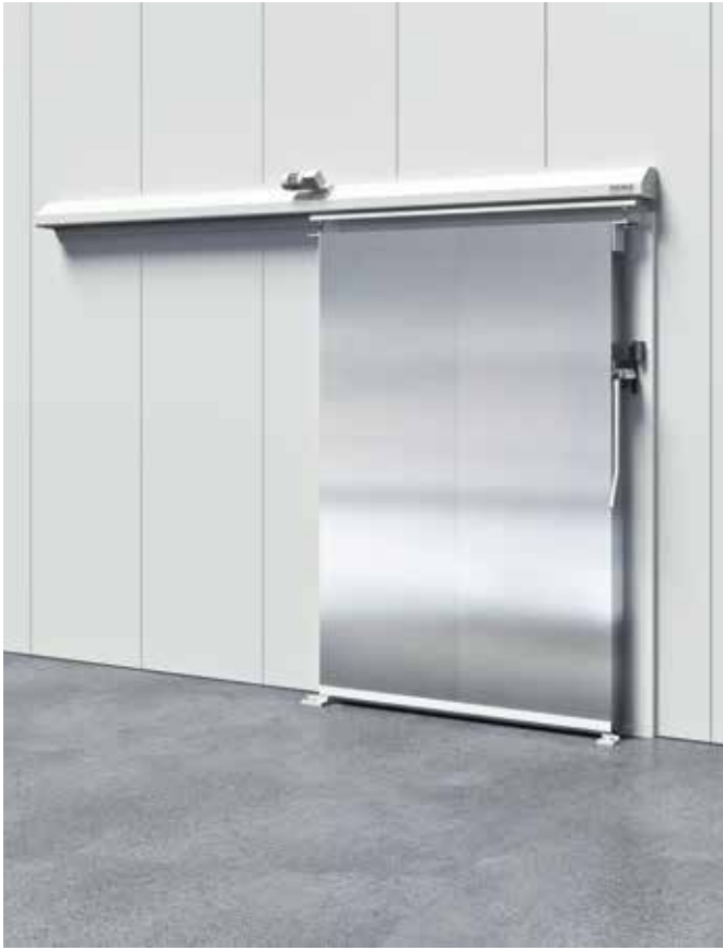
Sliding doors with SAE 304 stainless steel for cold-store and deep-freeze rooms with automation