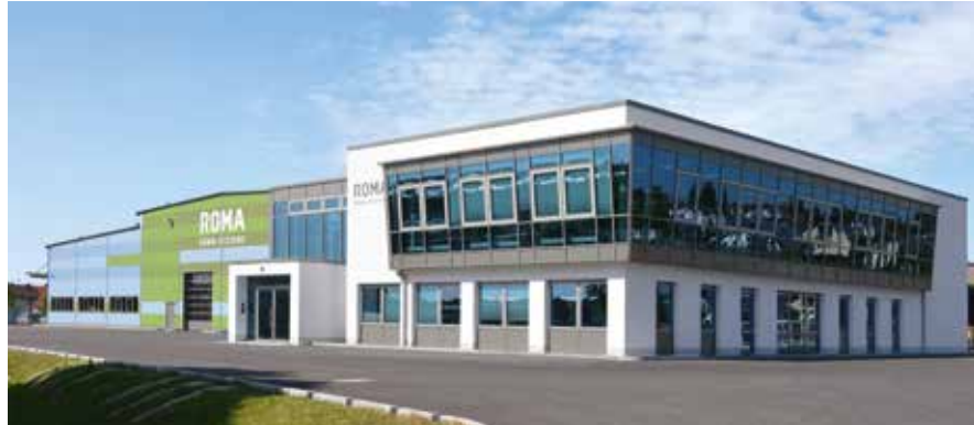
The ROMA Cells, Doors and Chambers Business Unit

Ever since its founding, our family-run business has always manufactured top-quality products Made in Germany.