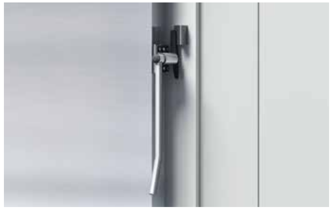
Standard outside handle