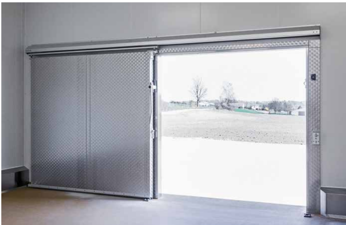
Sliding doors with SAE 304 stainless steel