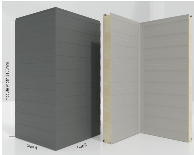
PIR-Wall panel corner Type PEP